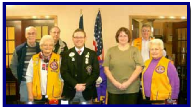
DG Simon's visit to the Nicholasville Club.